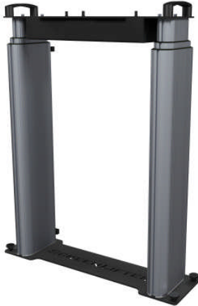
Lifting unit inclusive Microprocessor control. Also able for fixed installation or installation in a flight case.