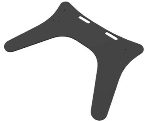
Base plate with rubber feet with special finish in RAL 9005. Extremely insensitive surface!