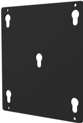
MS Audipack adapter plate.