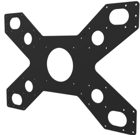
MS VESA mounting from 400 x 400 to 900 x 600 mm. Can be replaced with the Audipack adapter plates.