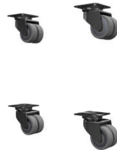
4 heavy duty casters. Optional for the base plate.

Case Weight: 46kg, 101 lb Case Dimensions: 1203 x 513 x 852 mm 47,3 x 20,2 x 33,5 inch