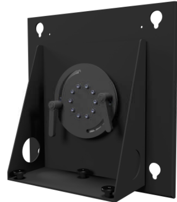
Column head with integrated 90° rotation. Only in conjunction with VESA mount MS.