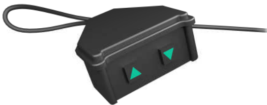
Handset control included.