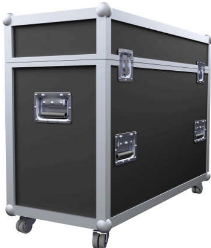
SL 75 flight case with very small packing dimension of only 105 x 44 x 86 cm.